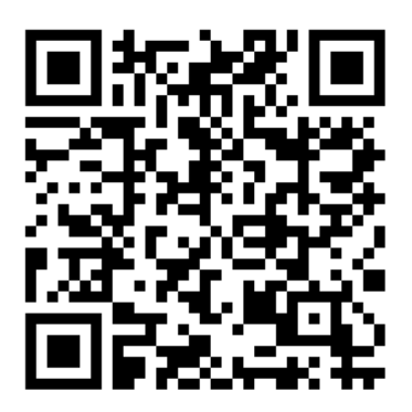
Research and Innovation Landscape of Malta