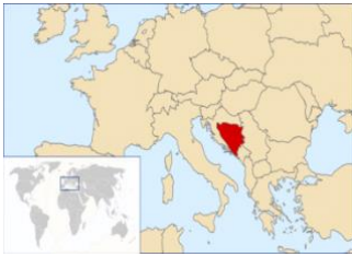
Bosnia and Herzegovina