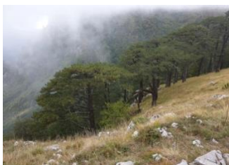
Sutjeska National Park