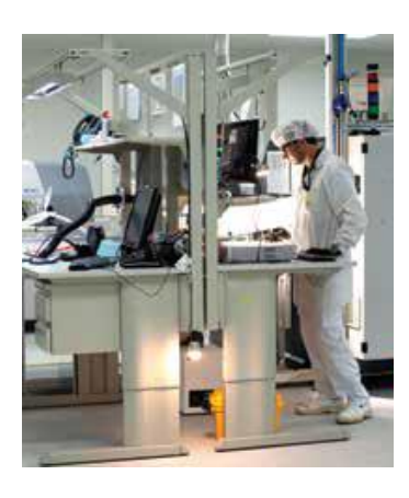
The company Light Environment Control (LEC), located in Spain, became the first company in Europe to light an entire city with LED technology.